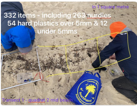
Transect 1 - quadrat 2 mid beach